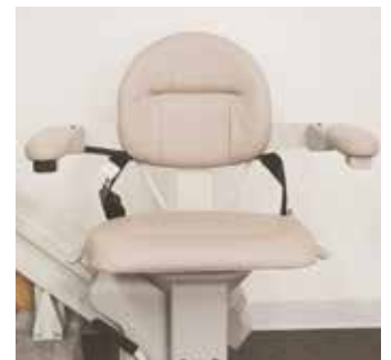
Larger seat and footrest for increased comfort.