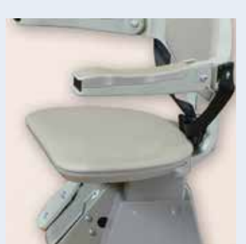
Power swivel seat for effortless exit. Armrest switch control or wireless call/send.