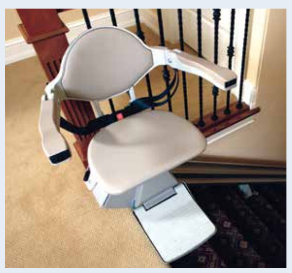
Padded, generous seat.