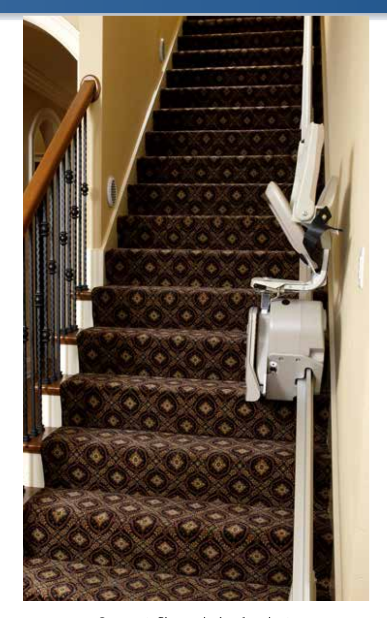
Compact, flip-up design for plenty of open space on stairway.

"Staff was very professional and helpful. The chair is wonderful and I will recommend the product and company."