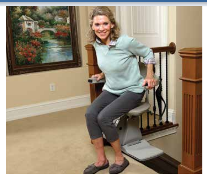
Offset swivel seat makes getting on/off easy.