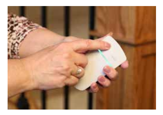
Two wireless call/sends allow remote control access.