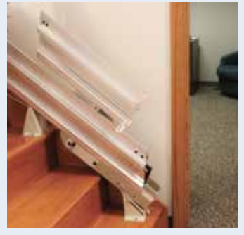
Power or manual folding rail for narrow hallway or when doorway is at the bottom of stairs. Manual operation or push button automatic.