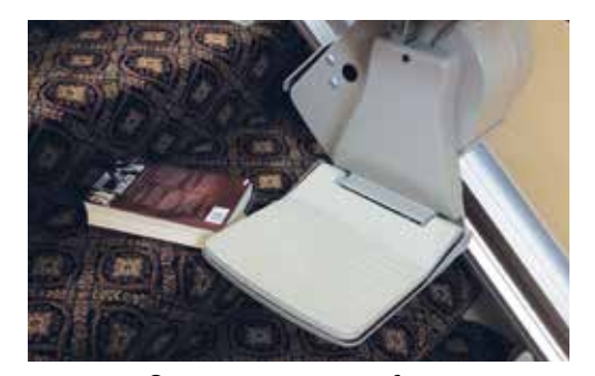
Sensors ensure safety.