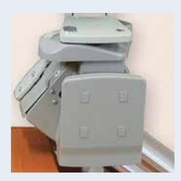
Power folding footrest automatically flips up/down when seat is raised/lowered. Arm switch control optional.